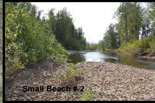
Small Beach # 2