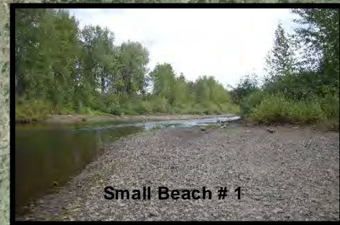
Small Beach # 1