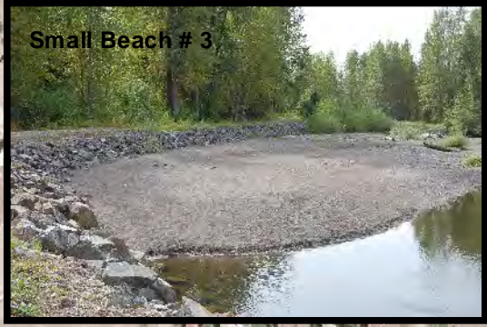
Small Beach # 3

Report a Poacher 1-877-952-7277 Wildfire Reporting 1-800-663-5555 Houston RCMP 911